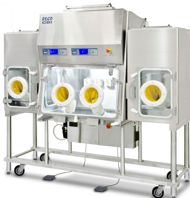
Containment Barrier Isolator (CBI)